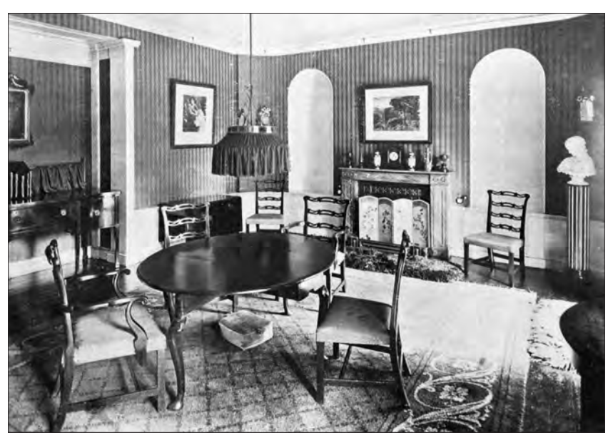
The Dining Room of Froyle House, described in a sale prospectus of 1915, as, "Handsome Georgian Dining Room, measuring 22ft by 19ft. This apartment is typical of the period, with alcove recesses on each side of the fireplace and sideboard recess. Lighting by two large French windows opening on to the Terrace, marble mantlepiece with register stove and tiled hearth. Service Door and Lobby."