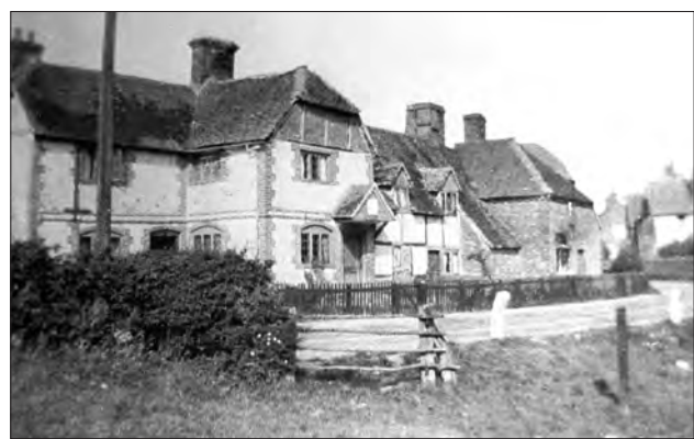
Westbrook Cottages, once very much part of the Lower Froyle landscape

Now the cottages are gone completely and the motorist has a clear view and so will be able to travel even faster, at this point, through the little village."