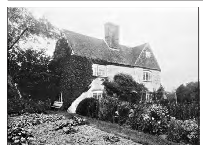
Beechcroft in 1915