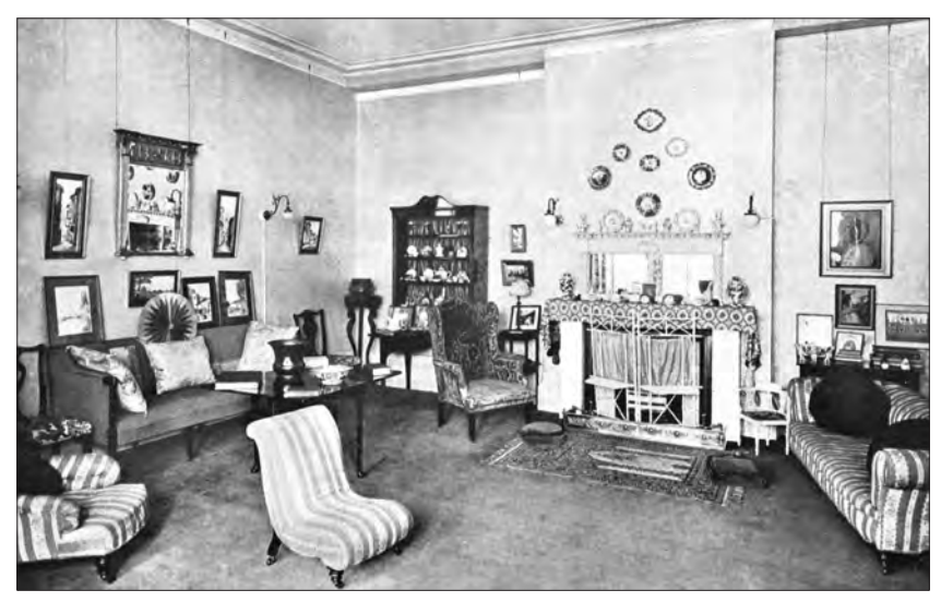
The Drawing Room is described as, "Spacious, measuring 25ft by 24ft, with large bay windows and French doors, giving access to the Verandah, marble mantlepiece, tiled sides and hearth and register stove."

"A feature of the Ground is the Magnificent Pergola, with a Grass Walk and long Herbaceous Borders on each side. There is a quantity of Wall Fruit, Ornamental Archways, Vinery, Heated Plant House and a range of Forcing Pits."