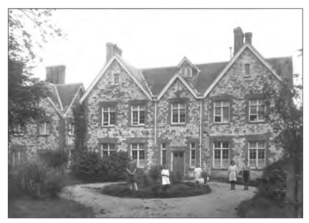
Yarnhams House in 1924