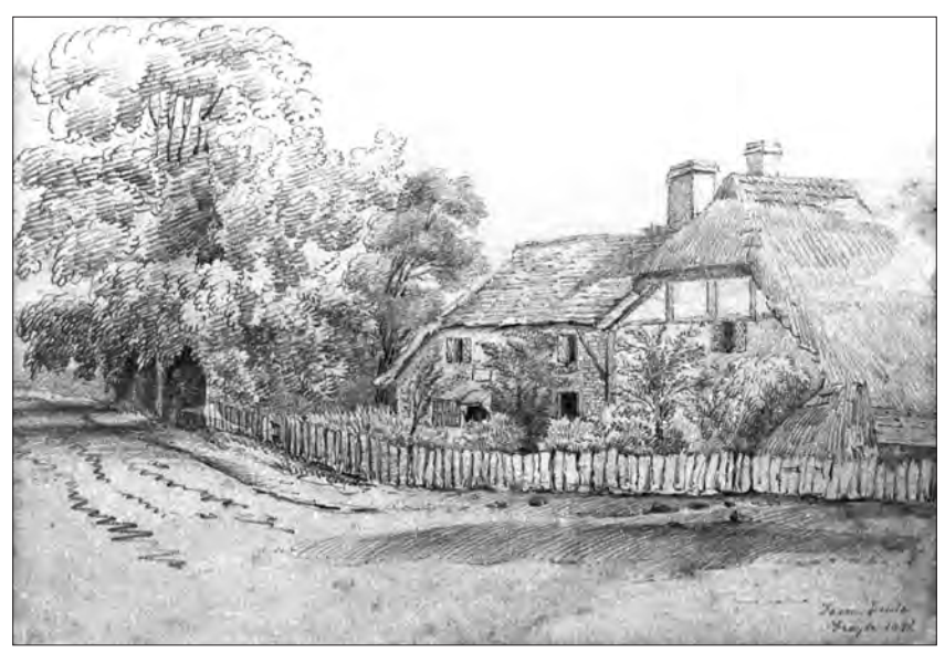
Blundens Farm House in 1836. The artist is unknown